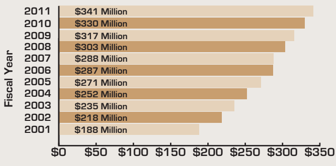
Gaming Revenue in Millions

Gaming Revenue for the School Foundation Formula